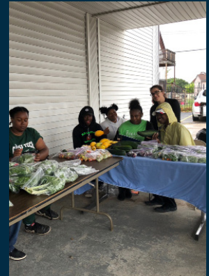
Our summer youth students setting up our farm stand at HUDA Clinic to provide our patients with fresh organically grown produce!