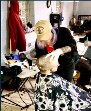
Haircuts for the Homeless.