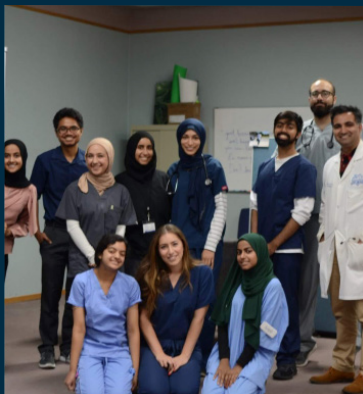
With dedicated volunteers, anything is possible!