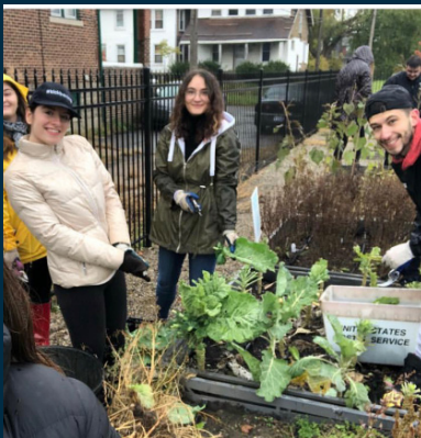
Mother Theresa Day event at the HUDA Urban Garden with the Albanian American Student Organization