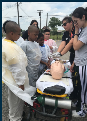
And this is what it's like to save lives everyday